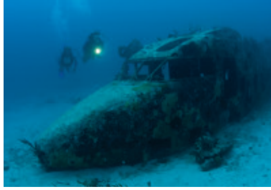
RHONE DAY Opposite: The screw of the famous Rhone — one of Nato's favorite dives in the BVIs. Above: This Atlantic Air BVI commuter plane found the runway at Dog Island a bit short.