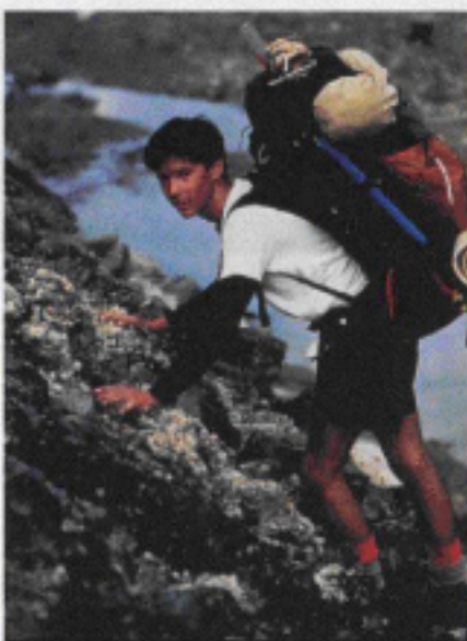
Interlocken students go for a mountain goat's view.

ACTIONQUEST sends teenagers to live aboard 51-foot yachts in Australia, the Galapagos, the Caribbean, or the Mediterranean, honing their skills sufficiently to earn internationally recognized sailing and scuba certifications. Longer programs offer high school or college credit. Three-week trips average $4,000. (800) 317-6789; www.actionquest.com